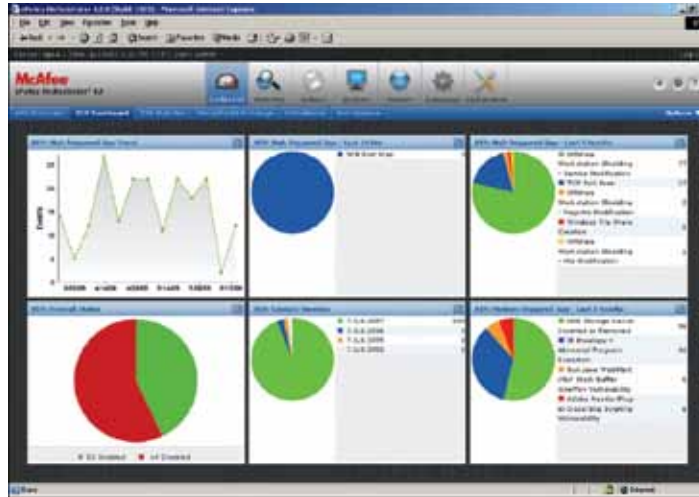
ePolicy Orchestrator makes viewing security and compliance data easy.